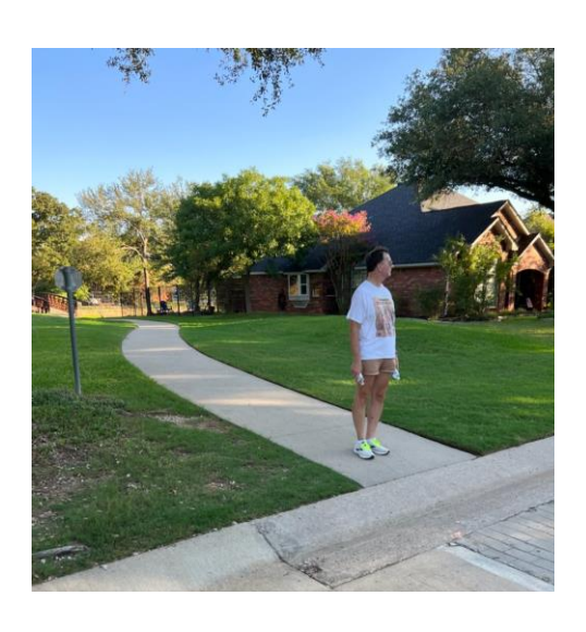
6) Second water station and only need ONE - TWO PARENTS . Park near 2530 Rosedale to set up.