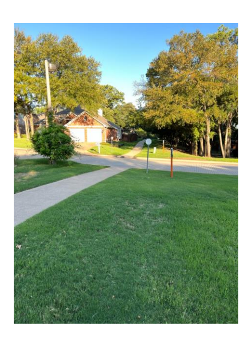
7) Street crossing and only need ONE – TWO PARENTS . You can park at the pavilion or near 2475 Glenridge Dr.