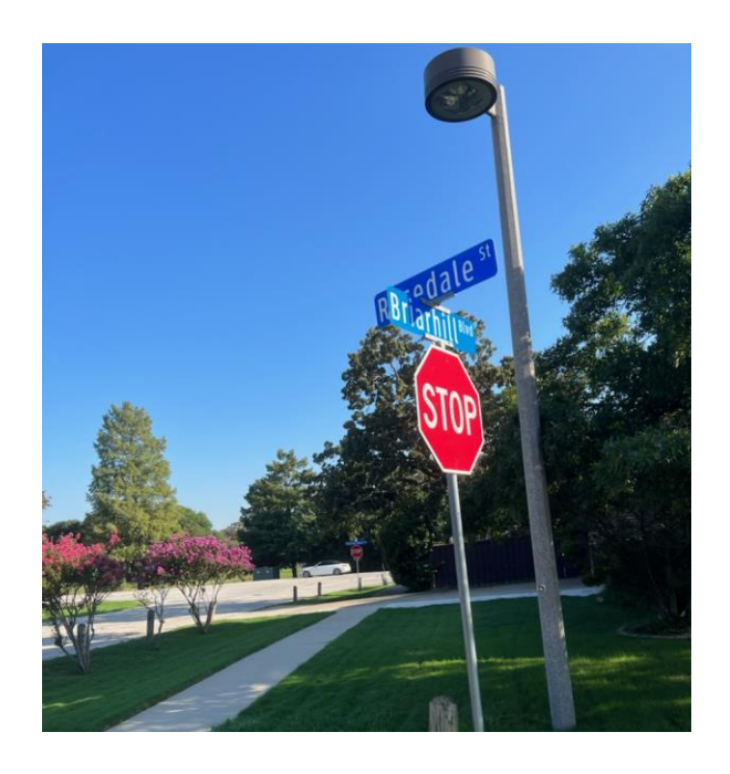
9) After crossing Briarhill and turning left, the next street is Rosedale and runners take a right. Only need signs