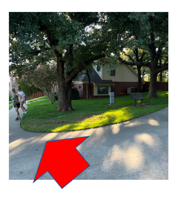
8) Stay to the left after crossing Briarhill. Same parent that helps them cross can point the way. This is across from DKH Academy. Same parent that helped them cross at McAuliffe. Needs safety vest.