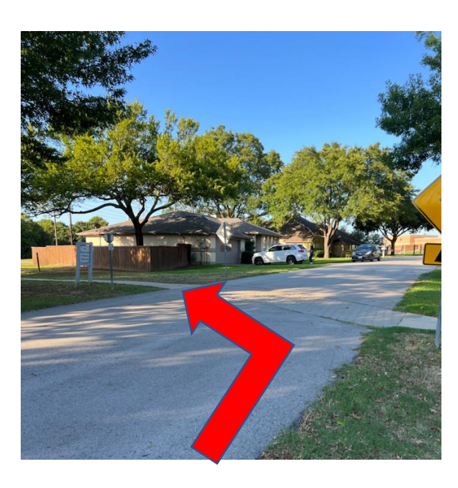
10) Follow Rosedale around to the right and take a left back on to the path. ONE-TWO PARENTS here and will also help with the next left turn