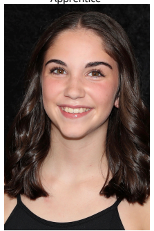
LakeCities Ballet Theatre Apprentice